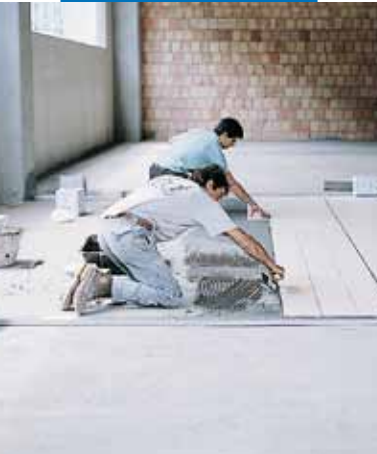
Installation of porcelain tiles in an industrial environment