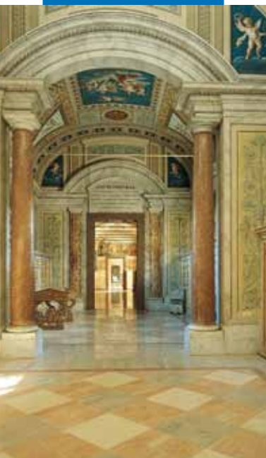
Sistine Corridors - Vaticano - Rome

All relevant references for the product are available upon request and from www.mapei.com