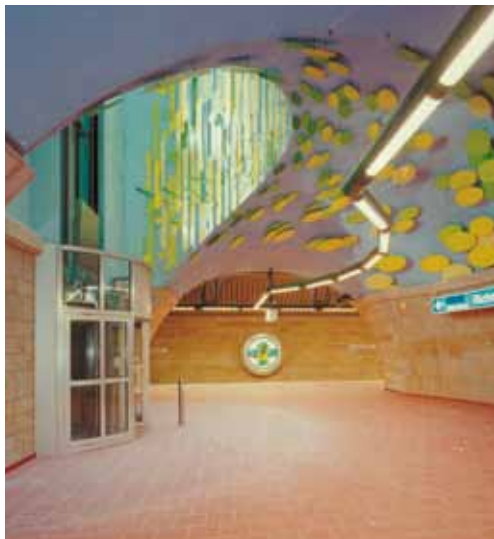
An example of an installation of granite with Granirapid Subway in Mulheim Ruhr (Germany)

Granirapid white: 28 kg packs. Component A: 22.5 kg bag. Component B: 5.5 kg drum.