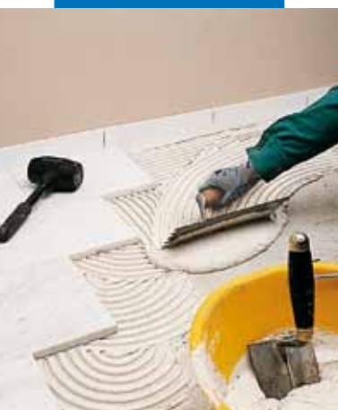
Installation of white Carrara marble with white Granirapid