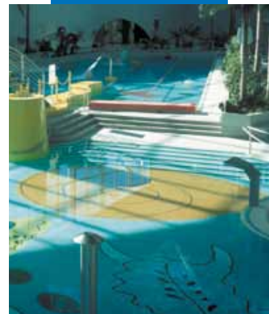
An example of mosaic and klinker installed in a swimming pool