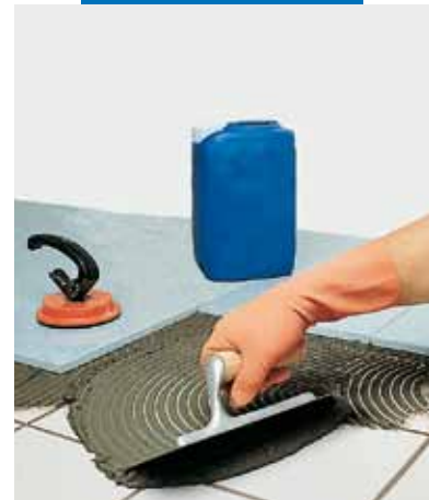
Overlaying ceramic tiling with an agglomerate mix using with grey Granirapid

Deformability according to EN 12004: S1 - deformable