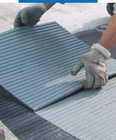
Overlaying rubber flooring on cement with Granirapid